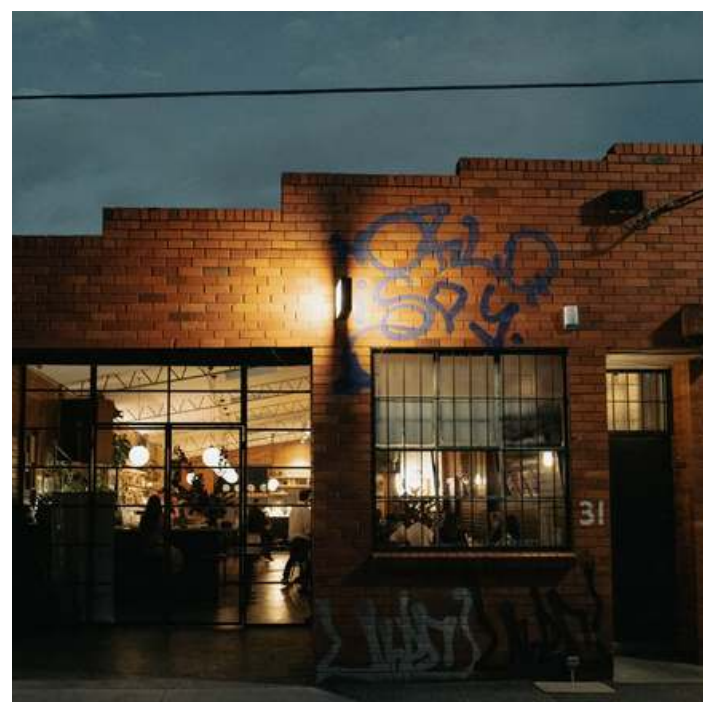
LILAC WINE AVAILABLE FOR LARGE GROUP BOOKINGS AND EXCLUSIVE VENUE HIRE.