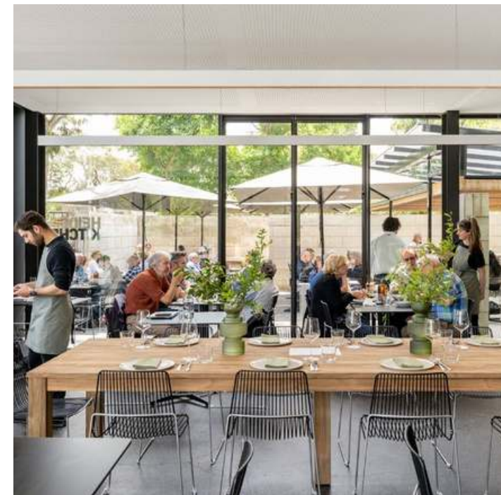
HEIDE KITCHEN AND SIDNEY MYER EDUCATION CENTRE AVAILABLE TO EXCLUSIVE HIRE FOR WORKSHOPS, PRIVATE EVENTS AND WEDDINGS