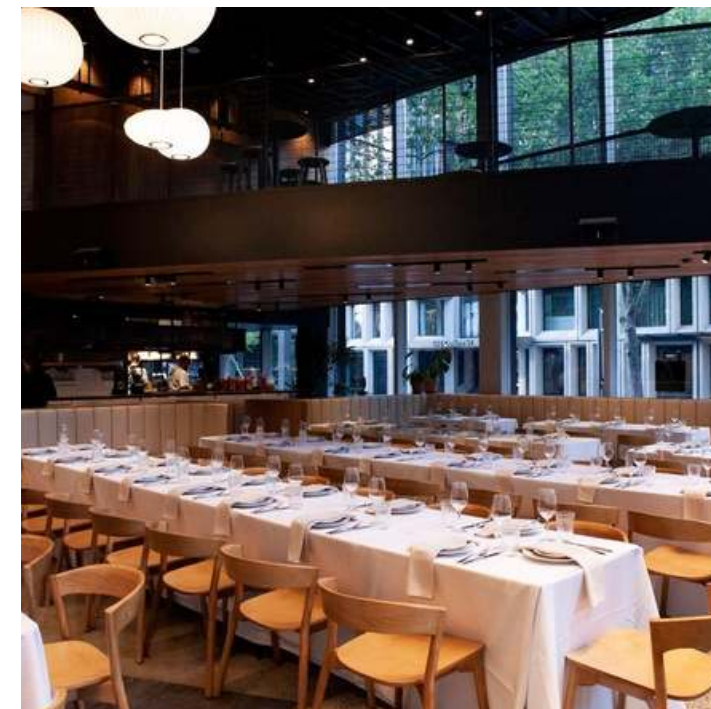
SQUARE ONE RIALTO

AVAILABLE TO EXCLUSIVE HIRE FOR LUNCHTIME WEDNESDAY-SATURDAY AND DINNER TUESDAY-SATURDAY